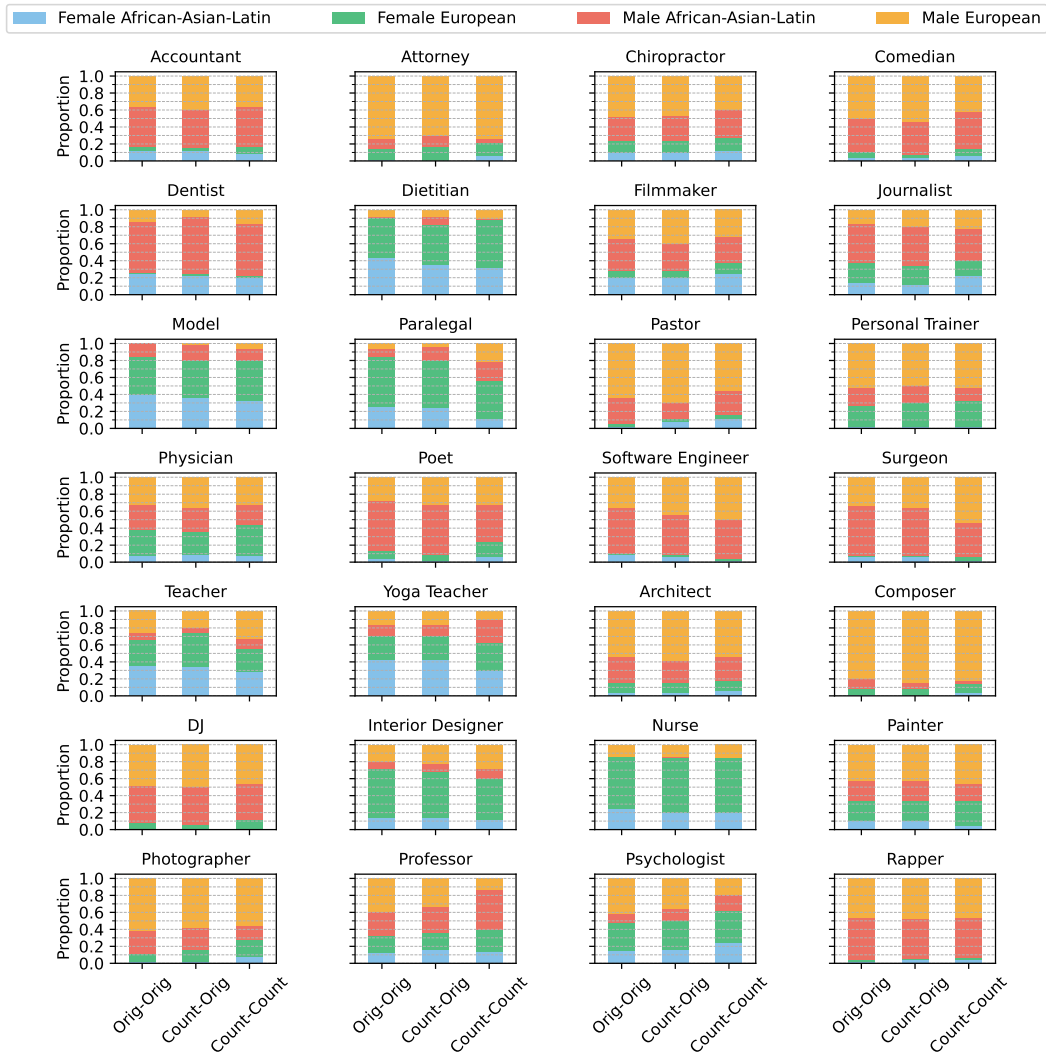
Figure 3: Distribution of the predicted groups in the top 10 by RankNet. Orig-Orig - the model was trained and tested on original representations. Count-Count - the model was trained and tested on the counterfactual representations computed using Model 1 on each occupation. Count-Orig - the model was trained on counterfactual representations and tested on the original representations.

pation without grouping, as there is no clear pattern for grouping the occupations due to the complexity added by the intersectional groups. Results (Figure 2 - SingleOccupation) show that estimating a causal model for each occupation captures the variations of bias in each occupation resulting in an increase in proportion across the sensitive groups for most occupations. Another solution to capture the variations of the direction of bias across occupations is to introduce a node in the causal graph representing the occupation. This indicates that the occupation has an influence on the bias present in the data,